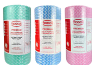
HEAVY-DUTY WIPES 40CM X 40CM 90 SHEETS/ROLL 45 METRES/ROLL