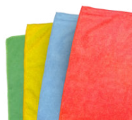
MICROFIBRE CLEANING CLOTHS 40CM X 40CM 10 CLOTHS/PACK